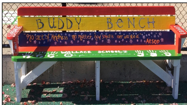
The new Wallace Buddy Bench courtesy of our friends at Hoboken High School.

We are excited to announce Wallace School now has a buddy bench for our playground! Students participated in a special unveiling ceremony on Friday, November 4th to learn about the buddy bench and how to use it. A special thank you to the following parties that were integral in getting students this special gift: